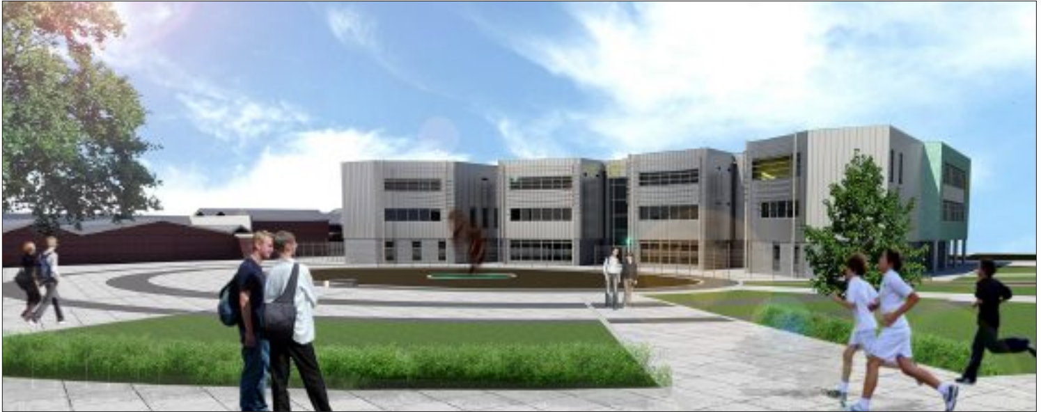
An artist's impression of the new £10 million University Technical College, which will start to take shape in September this year