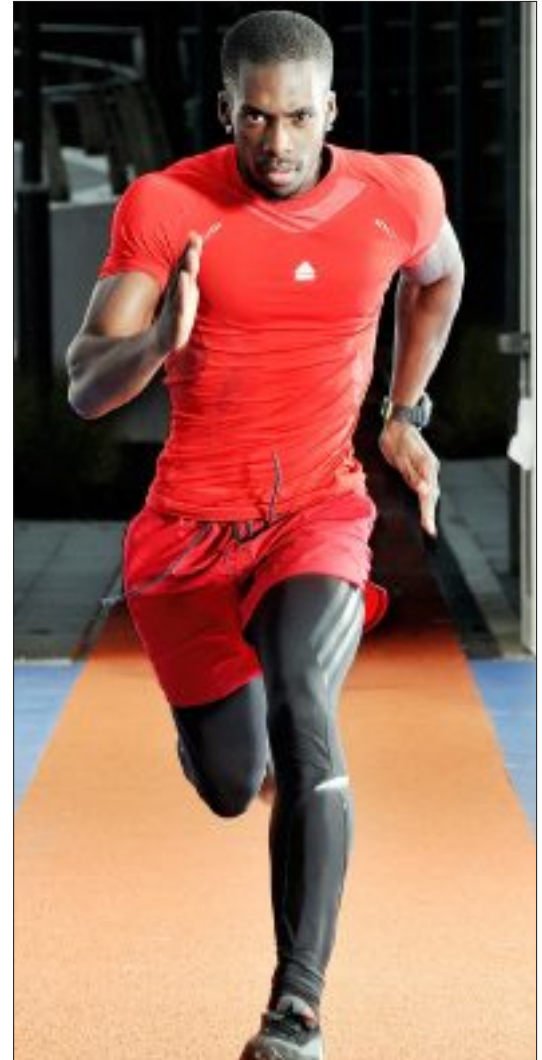
The research activity in health has been judged to be of international quality