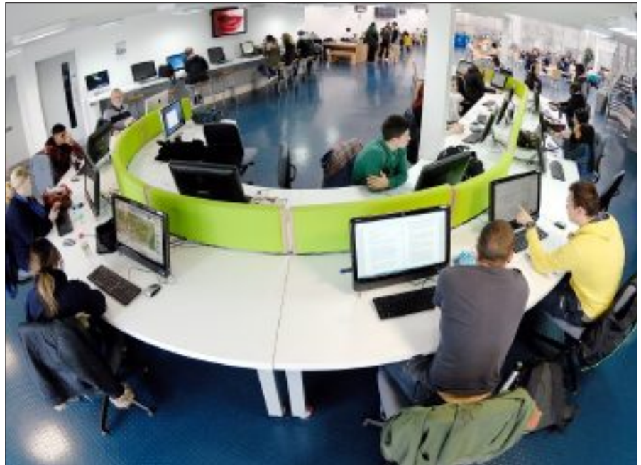
Students today in the new Social Learning Zone

Throughout the 1990s, the number of degree subjects expanded enormously but always allowing for the special emphasis on theory and practice, developed in the 19th century, enhanced in the 20th century, and still at the heart of our unique university today as we celebrate the start of our 190th year.