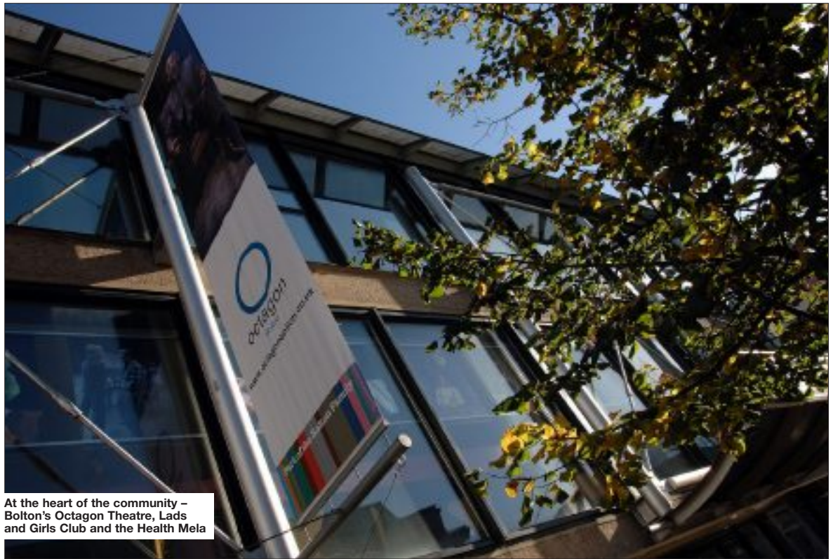
At the heart of the community – Bolton's Octagon Theatre, Lads and Girls Club and the Health Mela

The university has won awards for its community programmes, such as those developed to tackle bullying in schools, and praise for its leading role in hosting events such as the healthy lifestyle-focused Health Mela and the Science Festival.