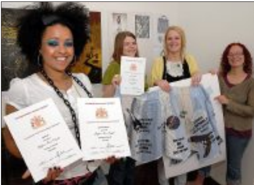
Textiles students scoop national prizes every year

of a modern university. Business and management studies, accountancy, law, computing and information technology, biological and environmental sciences, construction and health studies all expanded during this decade.