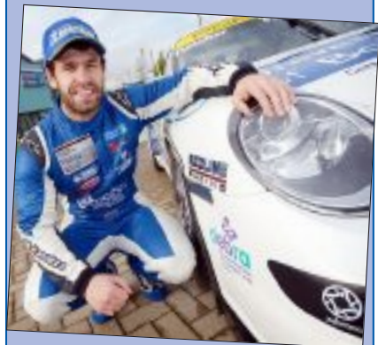
TV star and racing driver Kelvin Fletcher