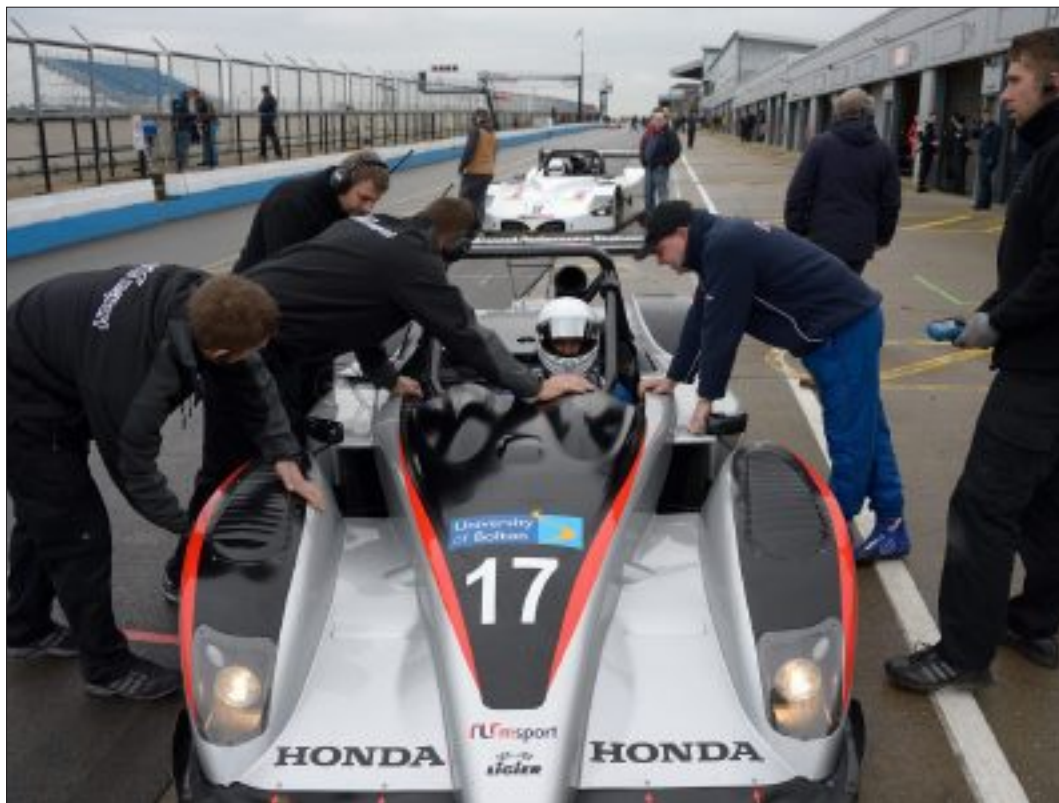
The new Centre for Advanced Performing Engineering (CAPE) is a high-performance engineering centre

EDUCATION for working people has been the driving force of the University of Bolton since its first days as a mechanics' institute in the 1820s.