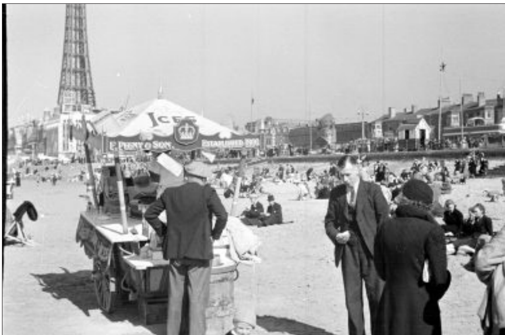
Blackpool, from the Worktown archive of photographs produced for the Mass Observation project in the 1930s