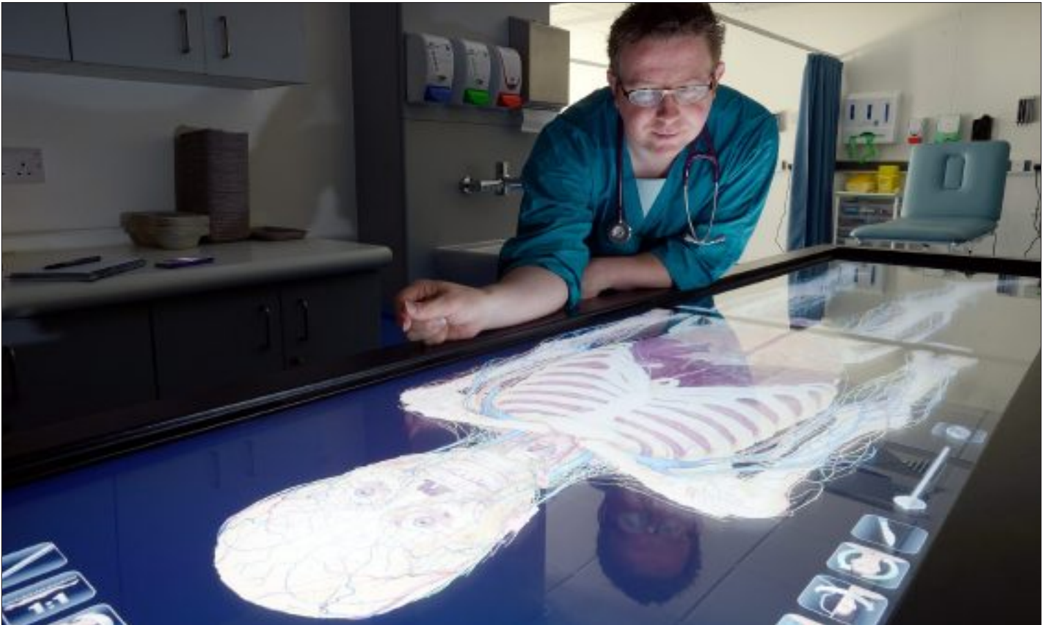
The hi-tech anatamage table allows students to carry out virtual procedures