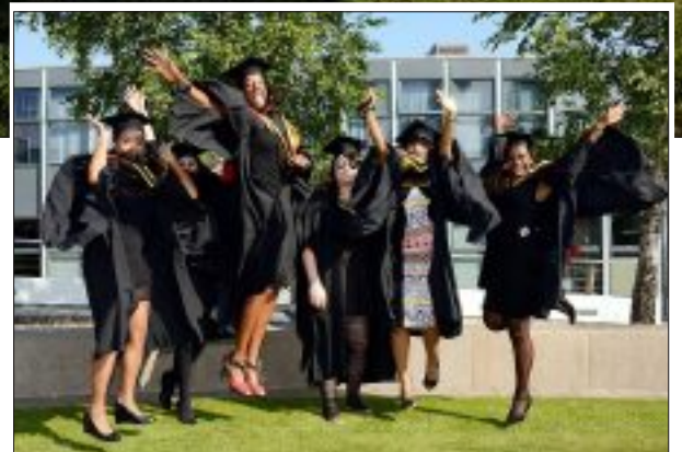
Graduates celebrate degree success and above, the campus with the Two Forms (Divided Circle) sculpture by Barbara Hepworth

I hope all of our partners, alumni and friends join us in our 190th year celebrations.