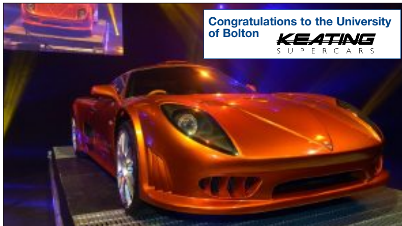
Students work on Keating Supercar 'The Bolt'

In the 1990s, many new subject areas were added to the university's portfolio, helping to create the all-round academic provision expected