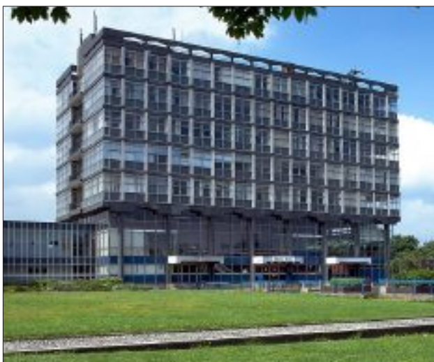
The former Deane tower