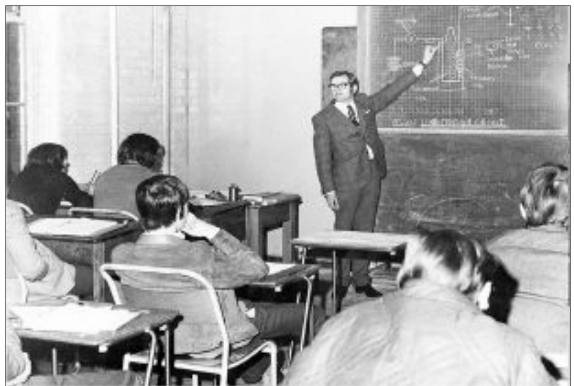
Students are taught in the former Deane Tower building