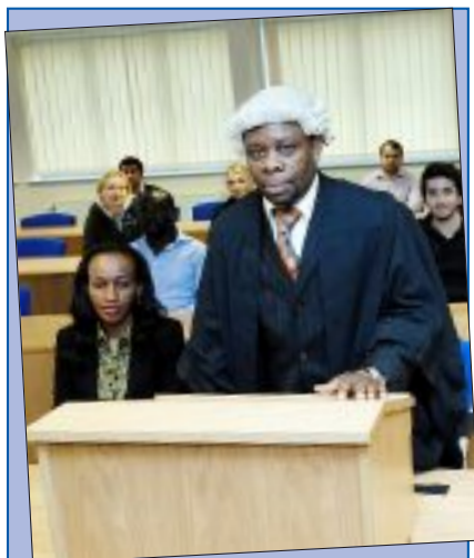
The Law School has its own courtrooms