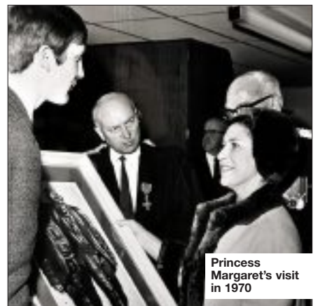
Princess Margaret's visit in 1970